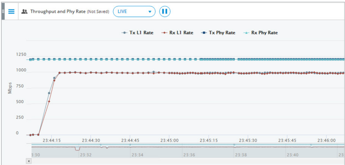
UDP Throughput Performance Example showing 2x2 MIMO, 1518-byte, Time Series from Spirent TestCenter IQ