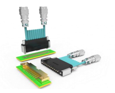
Figure 3: 8 channel coreHC to 1.85mm cable