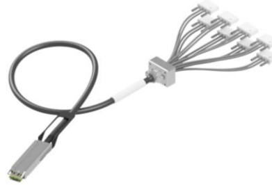
Figure 2 OSFP to SMPM Cable Assembly

This equipment contains ESD sensitive components and may become damaged when contacted with an electrostatic charge. To prevent equipment damage, please use proper grounding techniques.