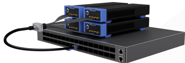
Figure 3 Switch Testing using 4 Pulsars.