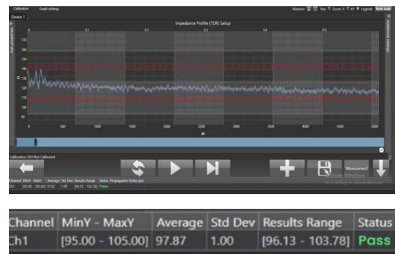
Figure 2 Impedance profile mask with pass verdict.

Pulsar's software allows the characterization of the DUT's impedance profile and return loss. The available or custom masks come with a Pass/Fail indicator to ensure the DUT's reliability in a few seconds.