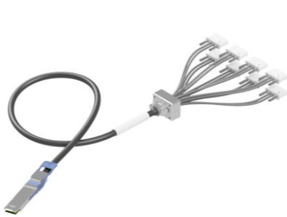
Figure 1 QSPDD to SMPM Cable Assembly