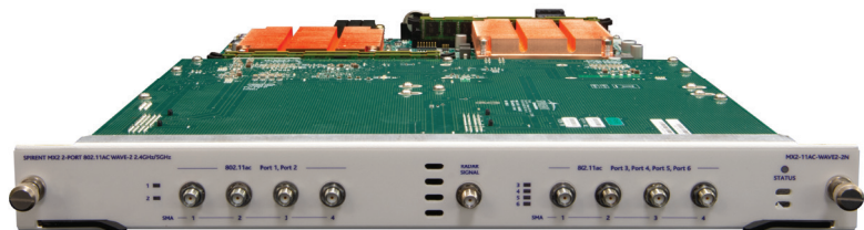
Figure 1: MX2 test module for 802.11 a/b/g/n/ac WLAN Wave-2 and DFS radar signal emulation.

The MX2 WLAN DFS test module offers the highest performance and consists of multiple IEEE 802.11 radios. It provides the maximum user configurability and flexibility to emulate various IEEE 802.11 a/b/g/n/ac clients on 2.4GHz and 5GHz and IEEE 802.11ac Wave-2 MU-MIMO clients on 5GHz band. A single WLAN radio supports 802.11ac Wave-2 clients with different spatial streams for the best realistic client emulation scenarios in either SU-MIMO or MU-MIMO. Designed for testing WLAN network infrastructure devices, including carrier or enterprise thin APs with controllers, consumer APs, and integrated broadband WLAN gateway, Spirent TestCenter WLAN solutions offer the best in class traffic generation and analysis for testing functionality, performance, and scalability.