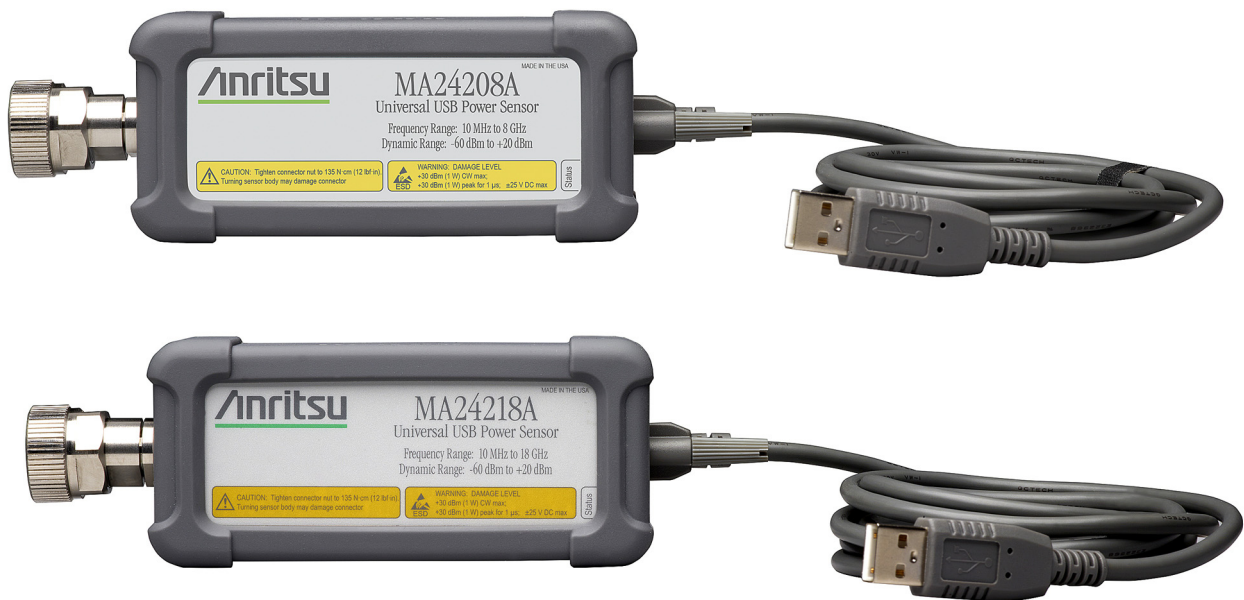
MA24208A and MA24218A Universal USB Power Sensors