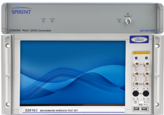
8100-B series example configuration.