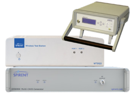
8100-Q750 with optional record & playback unit.