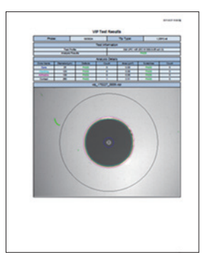
Simple User Interface and Report Generation