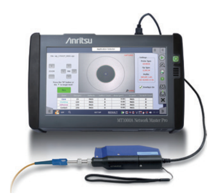
Available for MT1000A and MT1100A *Shown with MT1000A