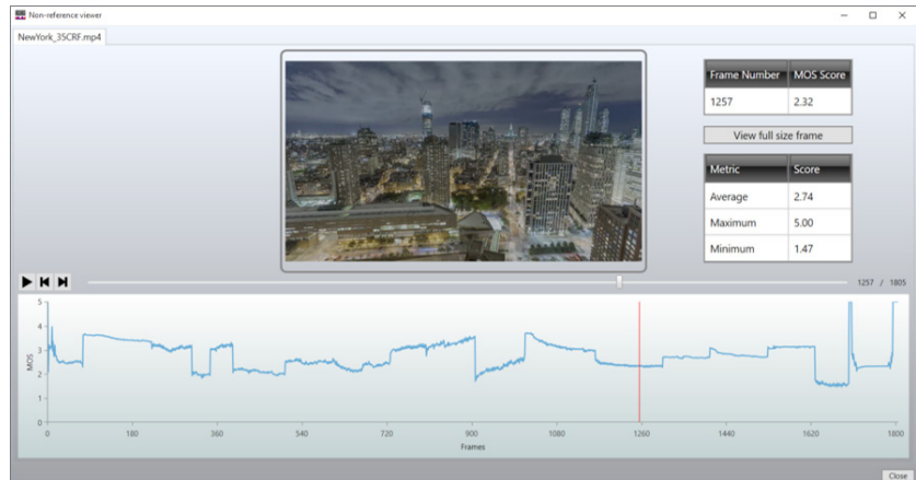
Interactive viewer showing video vs. MOS score

For more information, visit: www.spirent.com