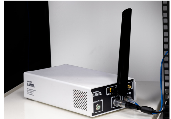
Fig.1: LSR-0360 Scanner hardware

RF Monitoring is an optional product feature available on the LAMTA software platform and offers users the ability to scan the RF environment in the lab and quickly see the results using LAMTA's GUI interface. The LAMTA RF monitoring solution includes LSR-0360 scanning receiver hardware and LAMTA software module.