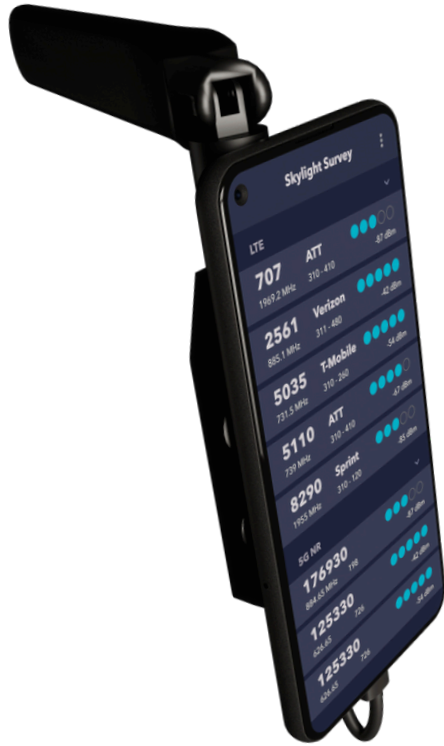
PRiSM mounted to smartphone

Offered with spectrum analyzer alone or with LTE, 5G NR, or P25 scanning software, or all technologies.