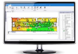
iBwave Viewer Freeread-onlyviewer for your clients.