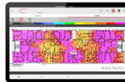
iBwave Mobile Survey Sitesurveymobileapp

Additionally, use iBwave's read-only iBwave Viewer to review surveys on design plans and share project information with customers and stakeholders.