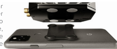
PRISM easily mounts to mobile devices and weighs under 24 grams (6 oz.)

Go beyond simple smartphone apps to get a detailed view of your cellular environment. PRISM is a self-contained, lightweight scanner and spectrum analyzer that easily connects to mobile devices to provide real-time, deep insight into coverage, interference and benchmarking. PRISM brings the power of large, expensive engineering tools to cost-effective handheld devices that can easily be used in the field. With PRISM, today's RF specialists get the tool they need to be productive and agile.