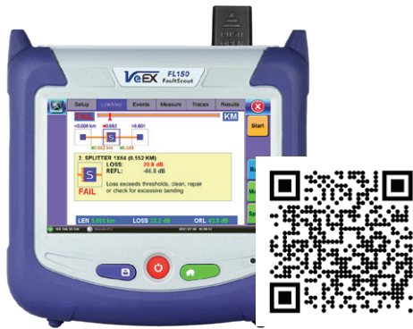
FL150 FaultScout® Multimeter