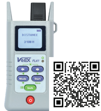
FL41 Optical Fault Locator