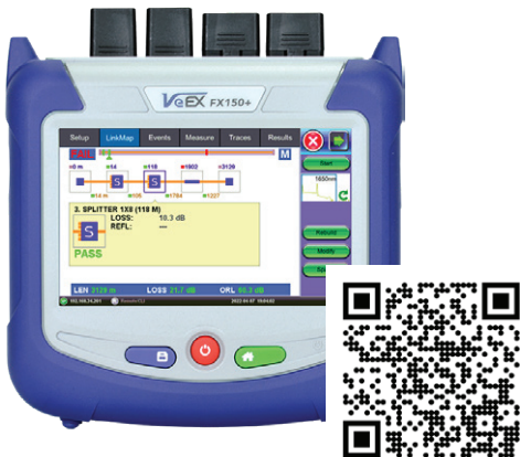
FX150+ PON OTDR