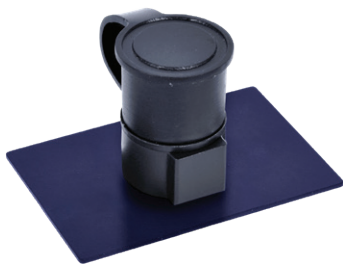
Optical Protector Cover (optional)