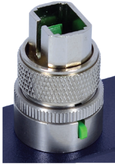
Optical Connector Protector

The innovative, patent pending field-replaceable optical ferrule system 1 adds an extra layer of protection to the internal end-face of calibrated optical test ports, preventing contamination and accidental damage.